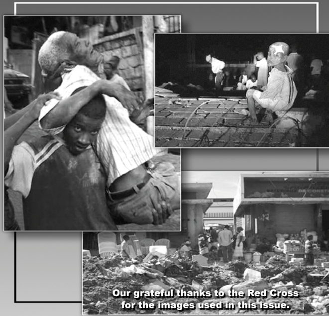
Our grateful thanks to the Red Cross for the images used in this issue.

“A voice was heard in Ramah, lamentation, and bitter weeping; Rachel weeping for her children refused to be comforted for her children, because they were not. Thus saith the Lord; Refrain thy voice from weeping, and thine eyes from tears; for... they shall come again from the land of the enemy [death].”